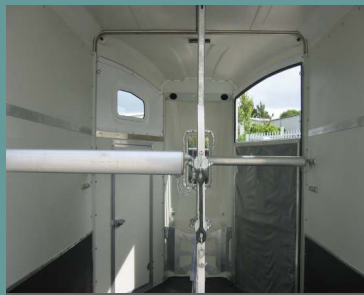
A stainless steel skeleton frame provides exceptional strength and durability