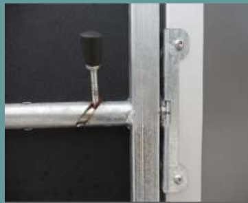
Heavy duty stainless steel ramp catches lock into place securely