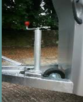
The self-retracting jockey wheel takes the inconvenience out of unhitching