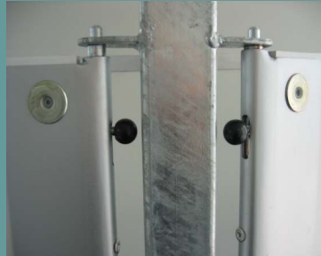
Spring catches allow the centre partitions to be removed with ease