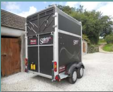
Visually appealing, spacious interior and an exceptionally solid tow... everything your horse deserves.