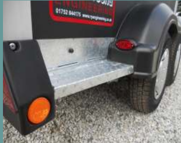
Reinforced, integrated step suitable for mounting your horse