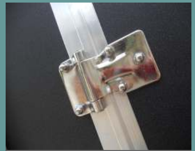
Long-lasting stainless steel hitches, emphasise the quality of the Nugent Trailer