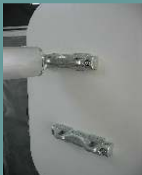
Adjustable breast bars to accommodate all shapes and sizes!