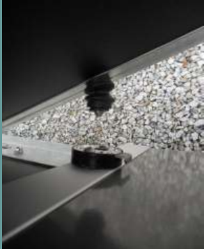
A grooms door retaining catch keeps the door firmly open on those windy days