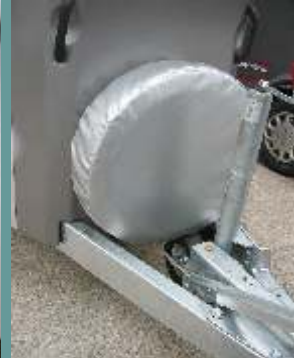
The spare wheel is stored neatly on the front axle leaving more room inside