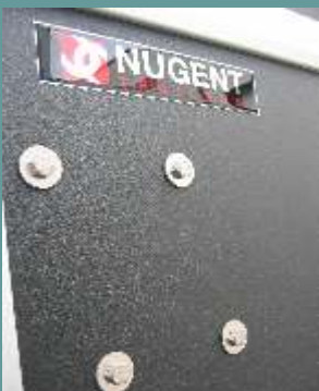
Breast bars can be safely released from outside the trailer - a vital safety feature