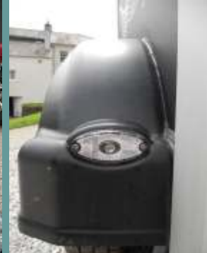
LED long life lights are fitted to each wheel arch as well as the top of the trailer