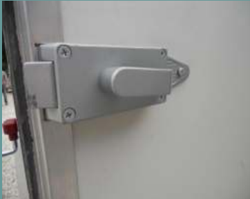
Lockable grooms door with aluminium latch, all features designed to last