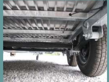
Fully welded and galvanised chassis provides exceptional strength and stability